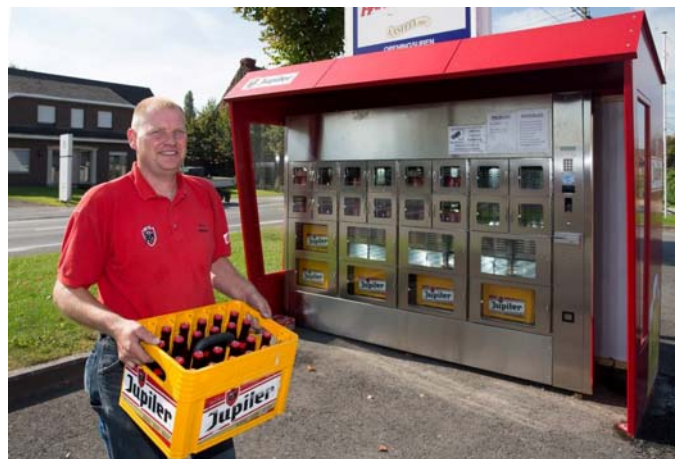
The first beer crate vending machine in Belgium.