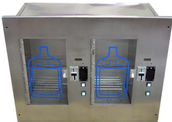
Wall Mounted Water Vending Machine

available in many different suitable grades. The most common one is the classic chromium-nickel stainless steel 304. Its excellent weldability and formability facilitate fabrication. When cost is a concern, ferritic stainless steels are an option. They are essentially iron-chromium alloys. The lowest cost variant is 12 % chromium stainless steel. Its corrosion resistance is lower than that of type 304; however it is an excellent choice when the bodies of the machines shall be painted. It does not require primers or other protective layers prior to coating, which simplifies manufacturing significantly. Chromium-manganese stainless steels of the 200 series are found in mechanical parts because of their high strength properties.