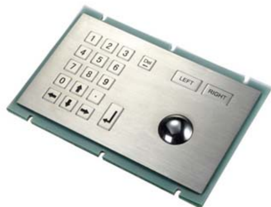
Stainless steel numerical key pad.

formability, which makes it possible to reproduce the most subtle contours with a high degree of precision and repeatability. The stainless steel surfaces are insensitive to water and dirt; the electronic components on the rear are encapsulated in a special membrane. Stainless steel is the perfect solution to shield sensitive electronics from robust environments.