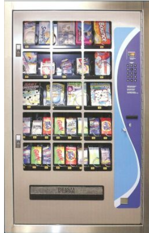
Stainless steel front door of a wall-mounted machine.

increases. As stainless steel doors are more difficult to break open than carbon steel doors of the same wall thickness, they are often used for machines containing valuable products or cash money that is attractive for burglars.